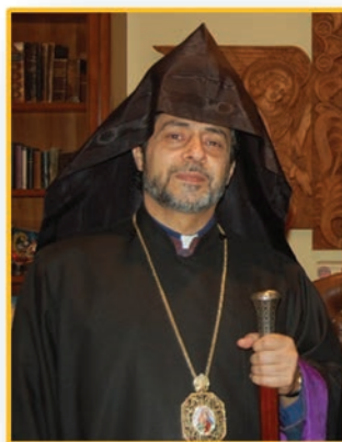
Archbishop Hovnan Derderian 2003-present